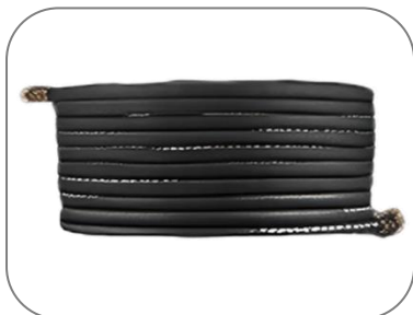
Compound high pressure hose - designed with multiple layers to withstand high pressures and maintain flexibility.