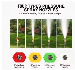
Adjustable nozzle adaption to different needs