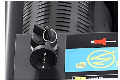
Electric start one-touch start for convenience