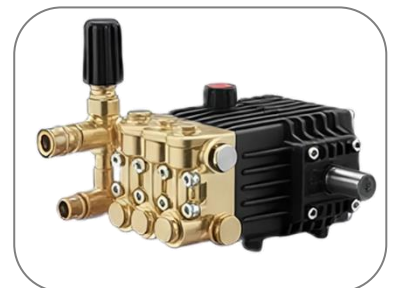
Copper high pressure pump - pump typically made with copper components and designed to deliver fluids at high pressure.

OurProductRange –Road Sweeper, Scrubber Driers, Vacuum Cleaner, Single Disc Scrubber, High Pressure Water Jet Cleaner, City Sweeper, Bins, Mop & trolley, Janitorial Product.