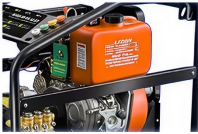
Fuel tank enlargement long hours and high efficiency