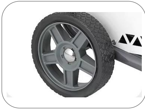
Solid Wheel - Wear-resistant PU wheel