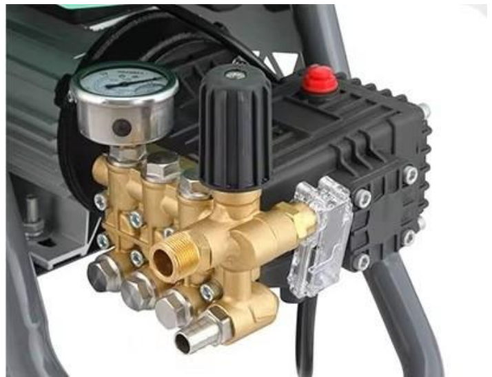
Brass pump, Ceramic plunger, Copper wire motor, Auto Stop, pressure adjustable

Our Product Range –Road Sweeper, Scrubber Driers, Vacuum Cleaner, Single Disc Scrubber, High Pressure Water Jet Cleaner, City Sweeper, Bins, Mop & trolley, Janitorial Product.