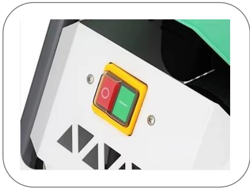
On/Off Switch – More convenient, Easy to Handle